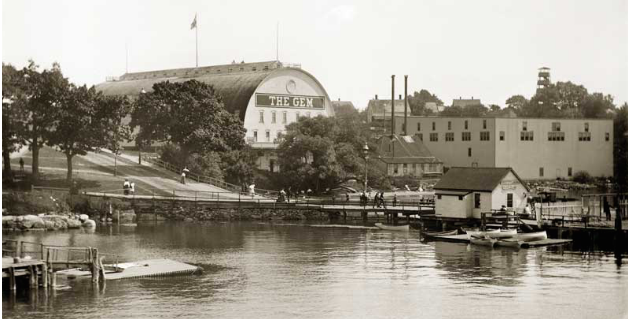
From a GEM THEATRE Playbill: